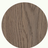
HALIFAX OAK ABAK SYNCHRO