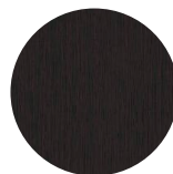
WENGUE REALISTIC PORE