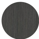
OAK MELINGA GREY